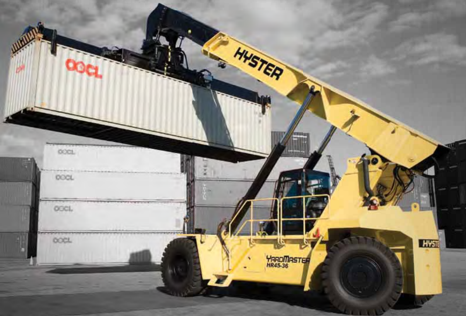
HR 45 ReachStacker