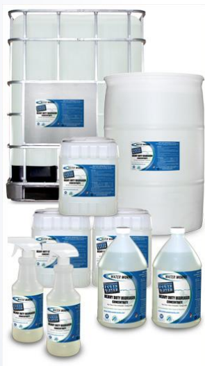
HEAVY DUTY Degreaser Concentrate / Blanket Wash