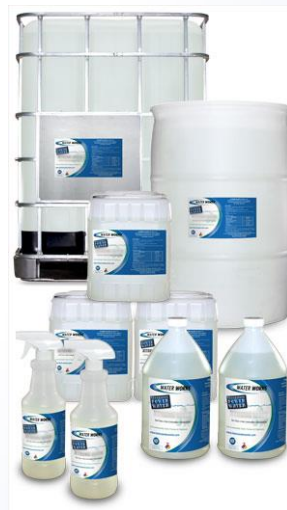
MAX XT - Coker Cleaner